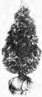
American Arbor Vitae

American Arbor Vitae ( T. occidentalis ). A tall growing tree of little width. Useful in Foundation plantings, for Hedges and as individual specimens. 3 to 4 ft., $3.25; 4 to 5 ft., $4.50.